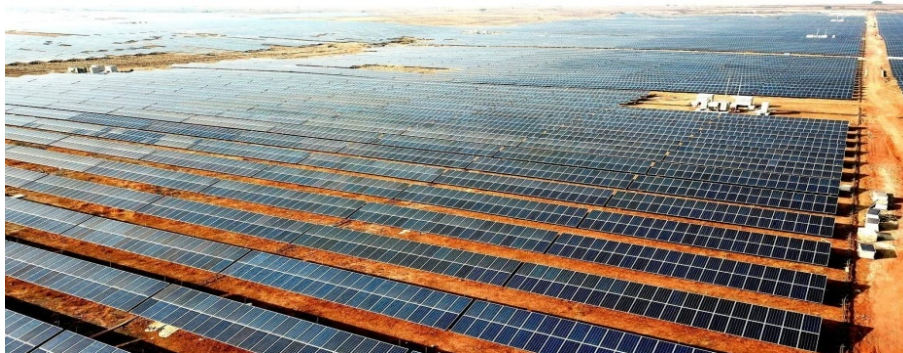
Fig 2: Dragon Scale Solar Tiles

Google Headquarters, California : As part of its commitment to sustainability, Google's headquarters in Mountain View, California, have a sizable solar panel installation that provides for a sizable amount of the campus's electrical demands. We are able to harness the sun's power from various perspectives thanks to these panels and the pavilion-style rooflines. Our dragon scale solar skin will create power for a longer period of daylight hours than a flat roof, which generates its peak power at the same time of day. This will reduce our contribution to the well-known duck curve in California, which shows the daily variation between the amount of energy required and the amount of solar energy available. Approximately 40% of the energy required by Charleston East and Bay View will be produced by the approximately 7 megawatts of installed renewable electricity when it is fully operational.